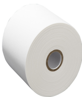
FILTER, PAPER 1 ROLL